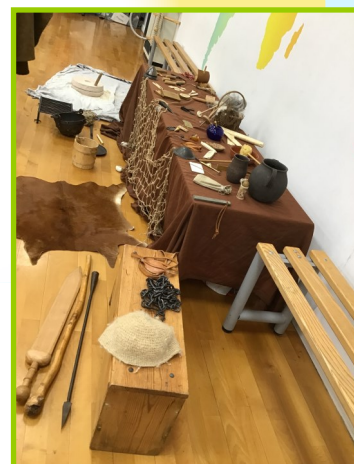
Year 4 Roman Workshop