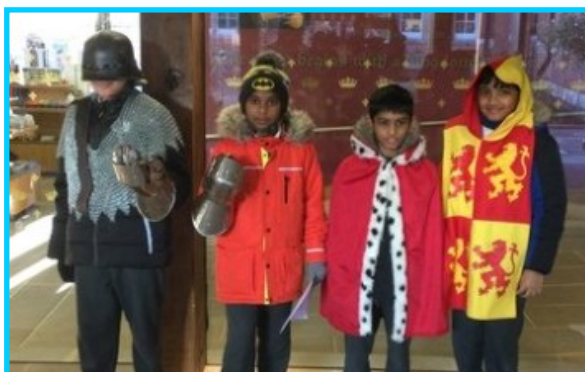
Year 5 at the Richard III visitor's centre

was life like in Roman Leicester?' and got to handle lots of everyday Roman objects. Year 3 and year 6 are studying lots of different periods of history. Year 3 will be thinking about how Britain has changed. Year 6 are asking 'Which was the greatest ancient civilization?' comparing Mayans, Greeks and West Benin people and their achievements.